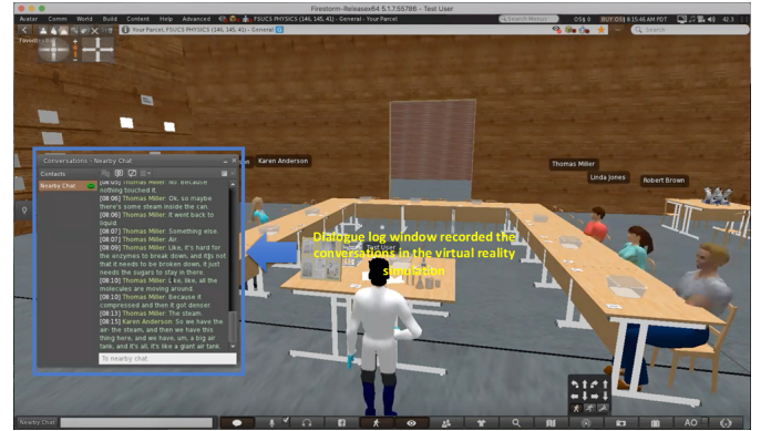
Figure 3: Dialog log window is a feature in Evelyn and EVETeach , a product of [24].

were encouraged to verbalize what they were thinking and doing in the VR simulation.