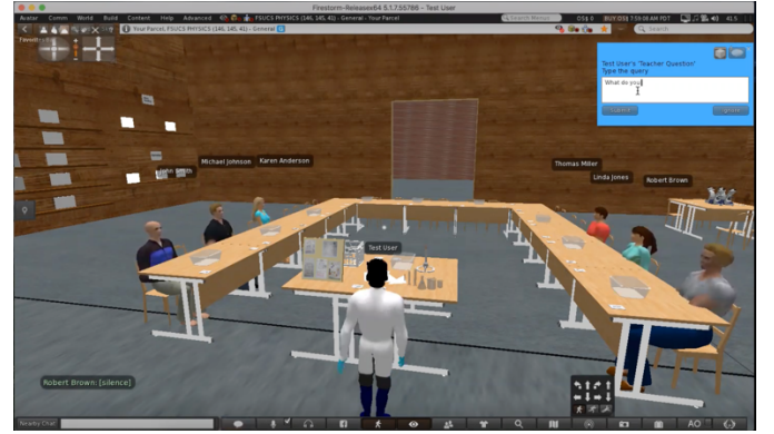
Figure 2: Classroom scenario configuration of Evelyn and EVETeach , a product of [24].